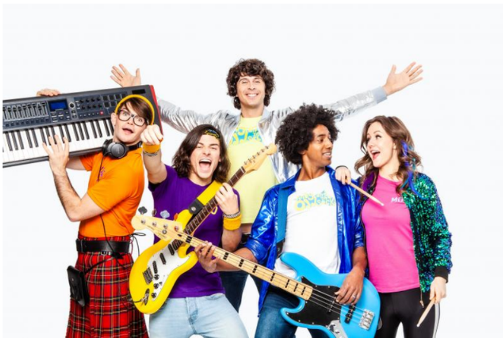
CBeebies' Andy and the Odd Socks!

All you need to do is wear odd socks! It's a great way to celebrate what makes us all unique in Anti-Bullying Week! Odd Socks Day is on Monday 13th November 2023.