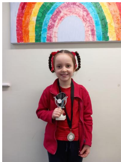
Our brilliant Brownie badges-earner and competitive creative champion