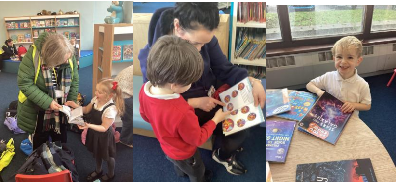
Well done, Reception, for your fantastic enthusiasm and curiosity about space!

Linked to our space topic, Reception also ventured on their very first school outing to the local library! They were very sensible walking across the road, and once there, enjoyed a wonderful story read by the librarian. Afterwards, they had the chance to explore the library and choose books to look at. It was a fantastic experience that helped bring their love of books and space to life in a whole new way!